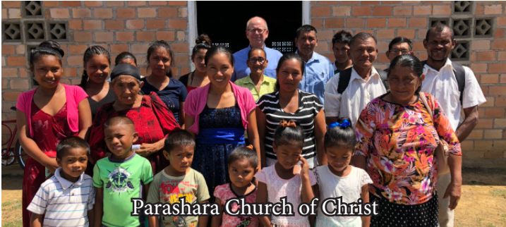
Parashara Church of Christ

I've been asked what this opportunity entails and gladly provide general guidelines and encouragement since I do not represent a particular US or Guyanese assembly in this.