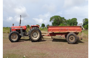
"Roll the gospel chariot along..."

"The true issues in life are not the struggles but the methods of resolution."