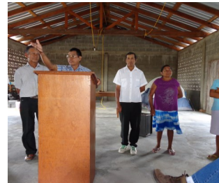
Sand Creek members ready to be partnered with crusade workers.